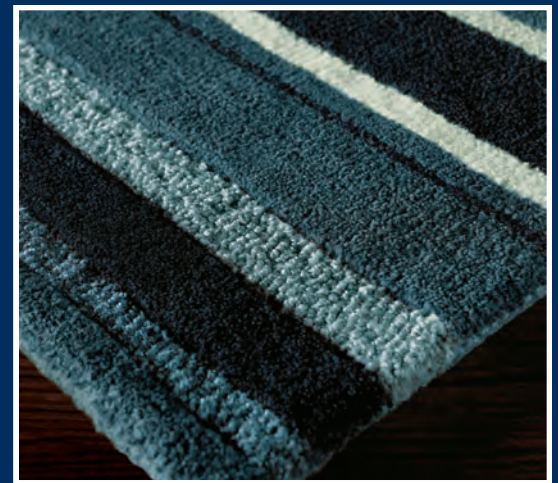
TUFTS DESIGN BY BARCLAY BUTERA MARINE STRIPE/C

PILLOW FABRIC TOP TO BOTTOM: PILLOW: SOMERSET-15 TRIM FABRIC: 27796-5 PILLOW: DRESSUR-51 TRIM ON PILLOW: TA5256-50 PILLOW: 30398-5 TRIM ON PILLOW: T30317-55 SIDE PILLOW: 30380-516